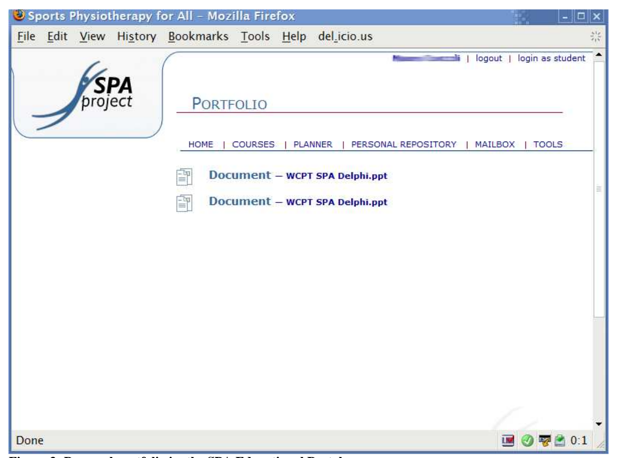
Figure 3: Personal portfolio in the SPA Educational Portal