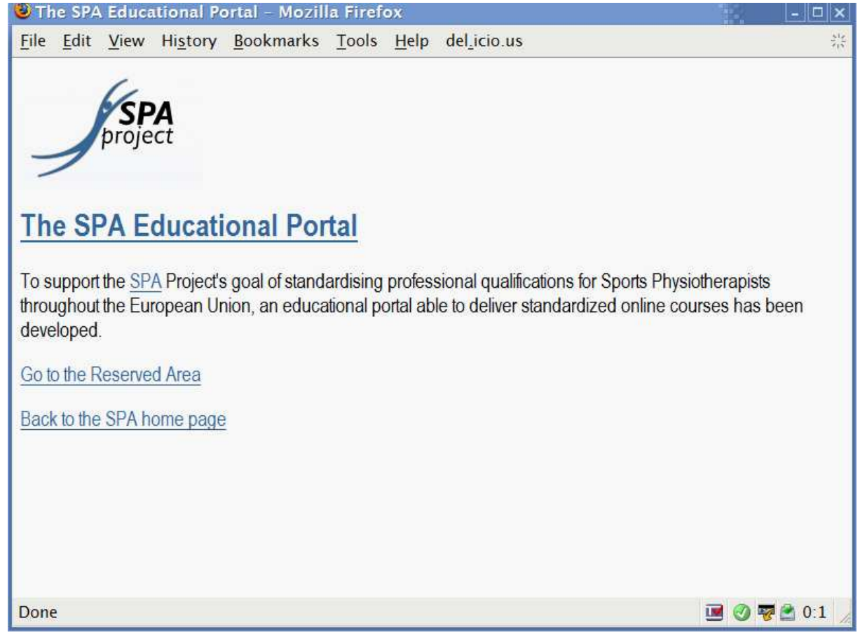
Figure 1: The SPA Educational Portal

The SPA Educational Portal (http://portal.sportsphysiotherapyforall.org) is based on the Open Source e-learning platform EifFE-L (available at http://sourceforge.net/projects/eiffe-l) and is designed to fully support this scenario. Figure 1 shows the home page of the SPA Educational Portal.